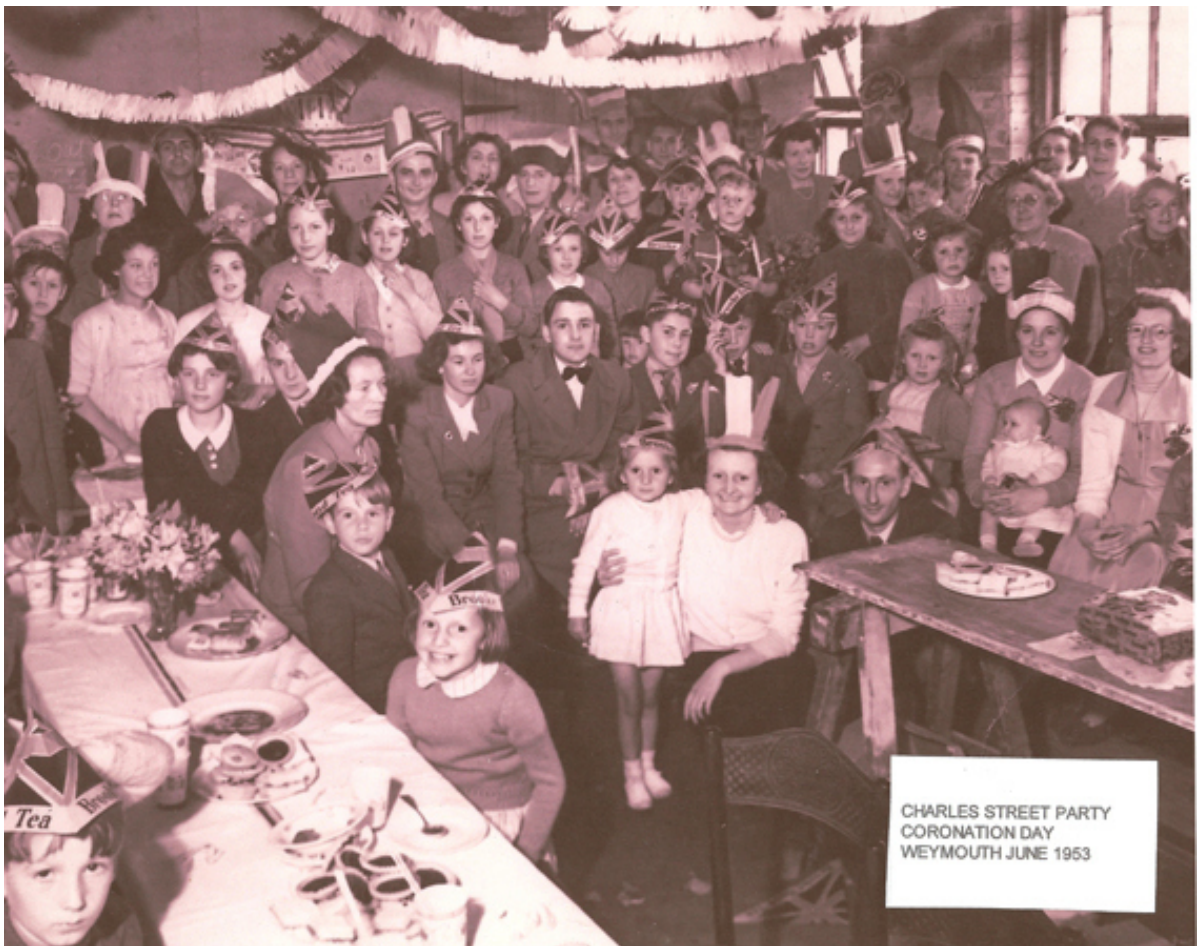
Charles Street Coronation Party 1953