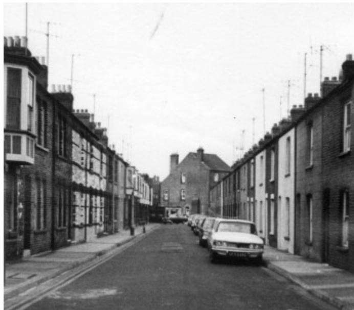
Charles Street 1967 – Gillian Hillidge

At twilight the lamplighter would come round. A small pilot light was always left burning in the gas streetlights, and using a long pole with a hook on the end, he would push the lever controlling the supply of gas to the jet, and with a pop the lamp would blaze. Each lamp post had a pool of warm yellow light around it and you would walk through alternate dark areas and lit areas as you went down the street. Each morning he would come back and turn the lamps off again. Gerry and Diana also recalled the 'knocker up' who (in the days before alarm clocks) would come round in the mornings to wake everyone up, so they'd get to work or school on time.