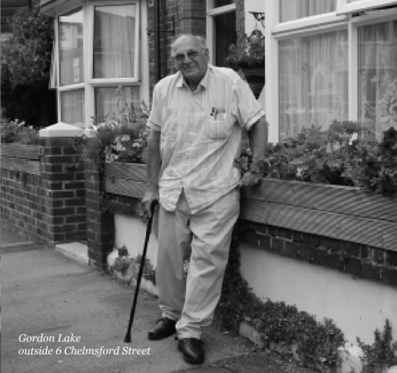
Gordon Lake outside 6 Chelmsford Street