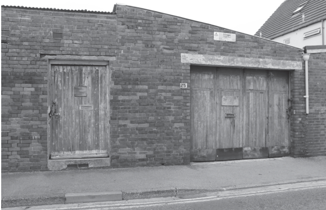
The Triangle 2014 – Mandy Rathbone

Many of the activities were seasonal, so in early summer they would make pea shooters from hollow swan feathers found by the lake, and collect vetch seeds to use for ammunition. In autumn they would play conkers and go scrumping from an apple tree on the corner of Cassiobury Road.