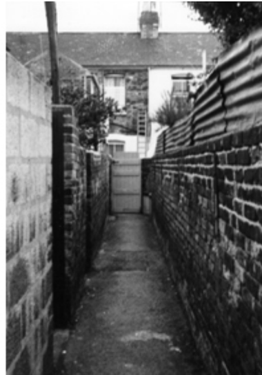
left: Alleyway off Walpole St 1967 right: Alleyway off the main alley from Walpole St 1967

The lanes were a great place to play 'hide and seek', and large groups of girls and boys chasing each other through the alleys was a common sight. People remembered playing 'kick the tin', 'knock down ginger', skipping games, marbles, jacks, roller skating and football. Hopscotch was popular,