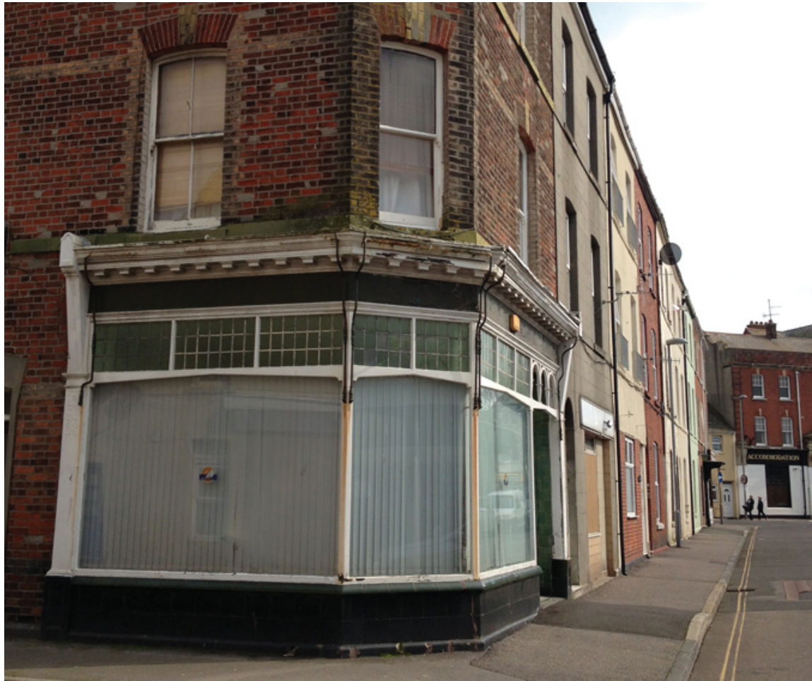
Nash's 2014 – Amy Hopwood

Les Nash, his wife Bet, and his five daughters, ran the bakery at 8 Ranelagh Road, as well as two other bakeries in Weymouth. Nash made more fancy goods than Bonds, but still only displayed bread in the windows. You bought only what you needed in those days, you weren't tempted just because something looked good in the window. They did make celebration cakes however, including Diana's wedding cake in 1956. It was a traditional fruitcake with two tiers, and the photo on the previous page shows the tier saved for the first christening. The building is now residential, but you can still see the elaborate shop windows on the corner of the old bakery and the beautiful green tiling around the doorway.