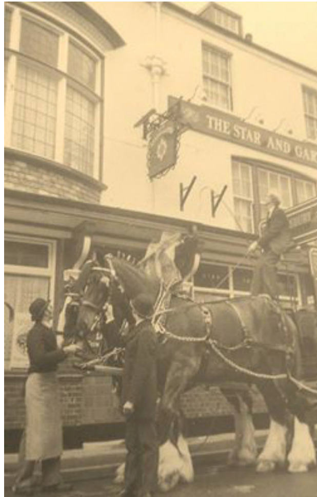
Star and Garter: believed to be 1930s – Stuart Berry

“The pub was a real ‘local’ pub – a bit off the beaten track for holiday makers staying in town and not one of the ‘night out’ pubs in the Park Street Shuffle or on a town/seafront pub crawl route. As a result it was always full of Park District locals from the streets immediately around it, with everyone knowing everyone else and seeing each other in the streets on a day to day basis and then in the pub most evenings – I grew up thinking I had 50 Aunts and Uncles! There was never any trouble – not that my Dad, who was ex-Royal Navy would have allowed it [...] There was a piano in the bar and I often went to sleep upstairs serenaded by the singing below – the lyrics to ‘Roll Out The Barrel’ I will never ever forget!”