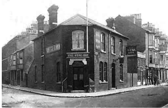
The Stag pub: believed to be 1940s