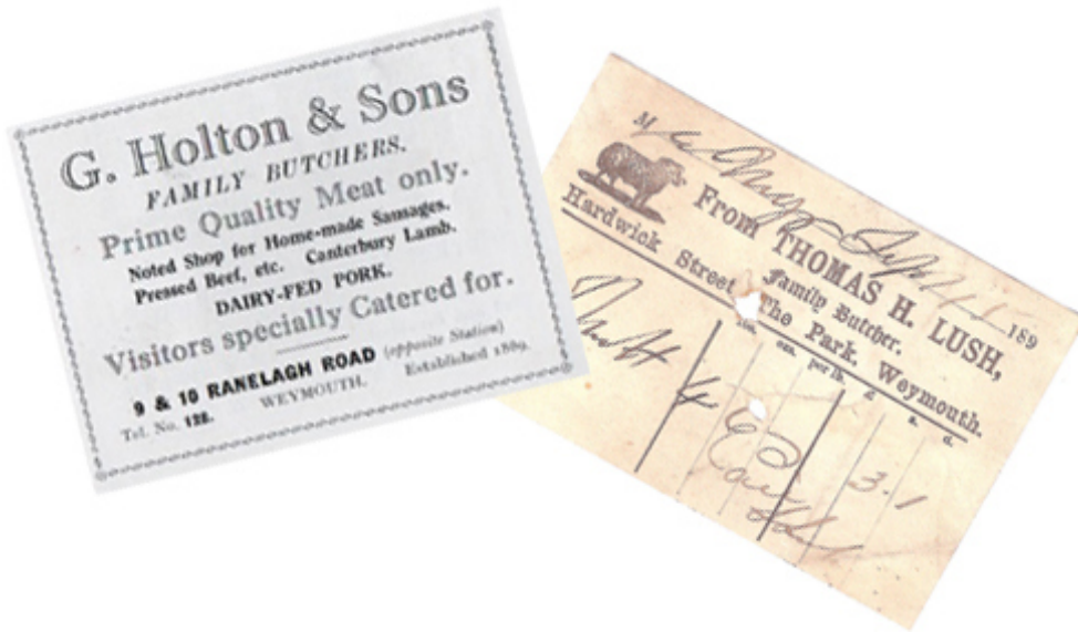
left: Advert – Holton and sons right: Receipt from Lush butchers, Hardwick St