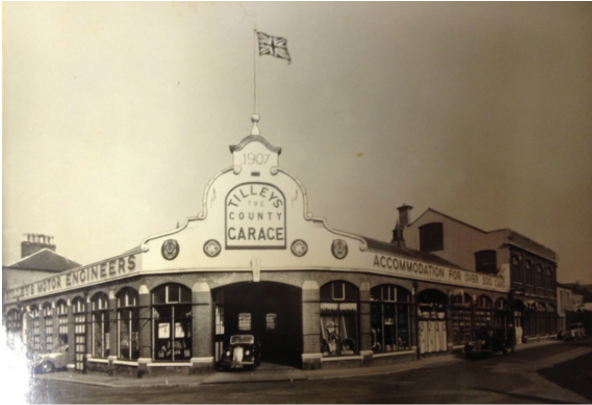
Tilleys 1950s – Weymouth Museum