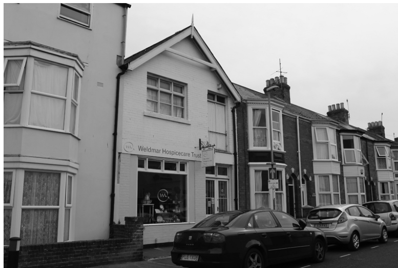
Site of the Co-op butcher in Brownlow Street 2014 – Mandy Rathbone

The group felt that when the big supermarkets came, and people stopped shopping on the estate, it killed a lot of the social life locally as when you were buying food every day you'd meet lots of people and have a chat with everyone you met.