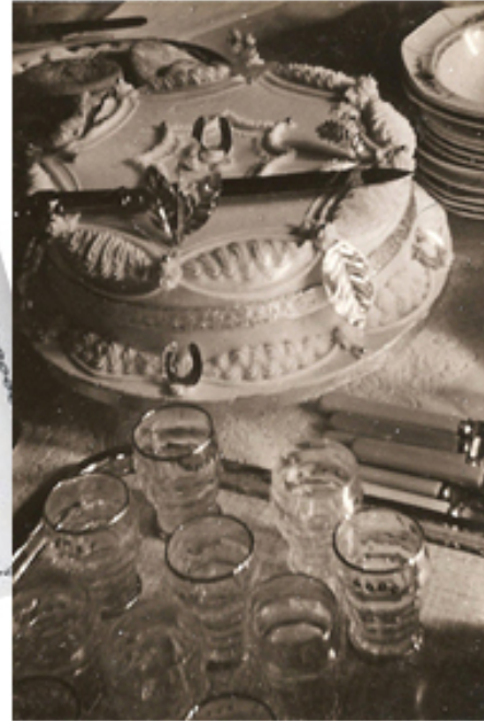
Wedding cake (Christening tier) from Nash's Bakery